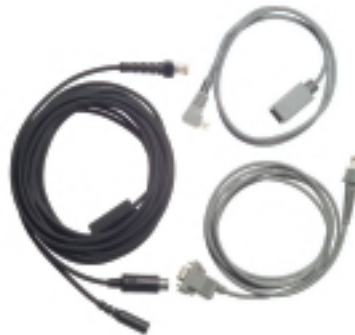
Point of Sale Cables

When you add our diverse capabilities to our guaranteed quality, on-time delivery, and competitive prices, SCI delivers an outstanding value package that is the perfect fit for all your OEM projects.